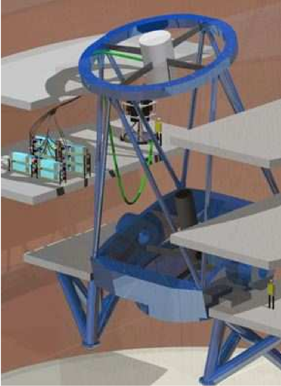
Fig. 2. A CAD rendering of WFOS on Subaru. The prime focus echidna fiber-positioner feeds \simeq 10 SDSS-like low-resolution spectrographs and a high-resolution spectrograph located in a special room close to the telescope.

20% error in dw/dz , when combined with Planck CMB and ground-based SNe data. This is as good a constraint on w(z) as expected from future space-based SNe experiments (see Glazebrook et al. 2005).